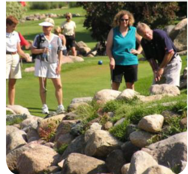
Mini-Golf Fundraiser – Centennial Lakes Park, Edina

A tremendous amount of volunteer time and energy is required to conduct these events and is a valued contribution. Additional volunteers are always welcome. This is a great way to contribute if financial circumstances do not allow monetary contributions.